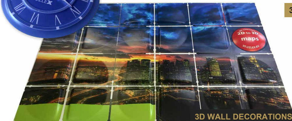
3D WALL DECORATIONS