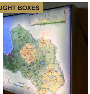
CUSTOM RAISED RELIEF PRODUCTS